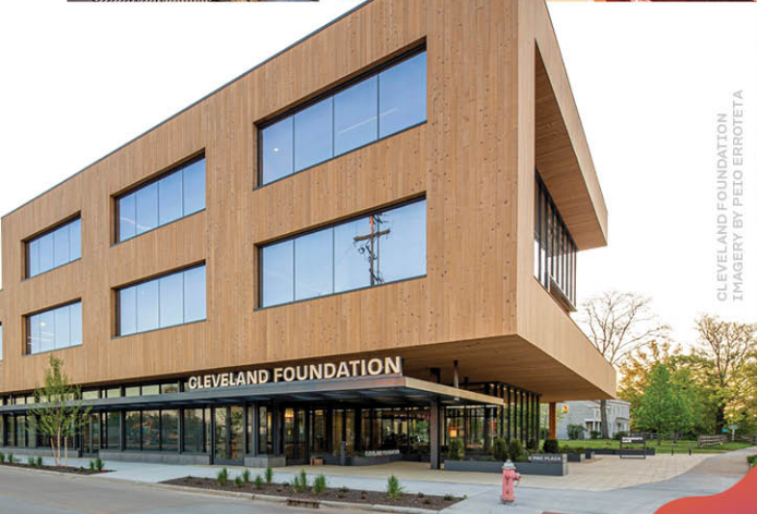
CLEVELAND FOUNDATION